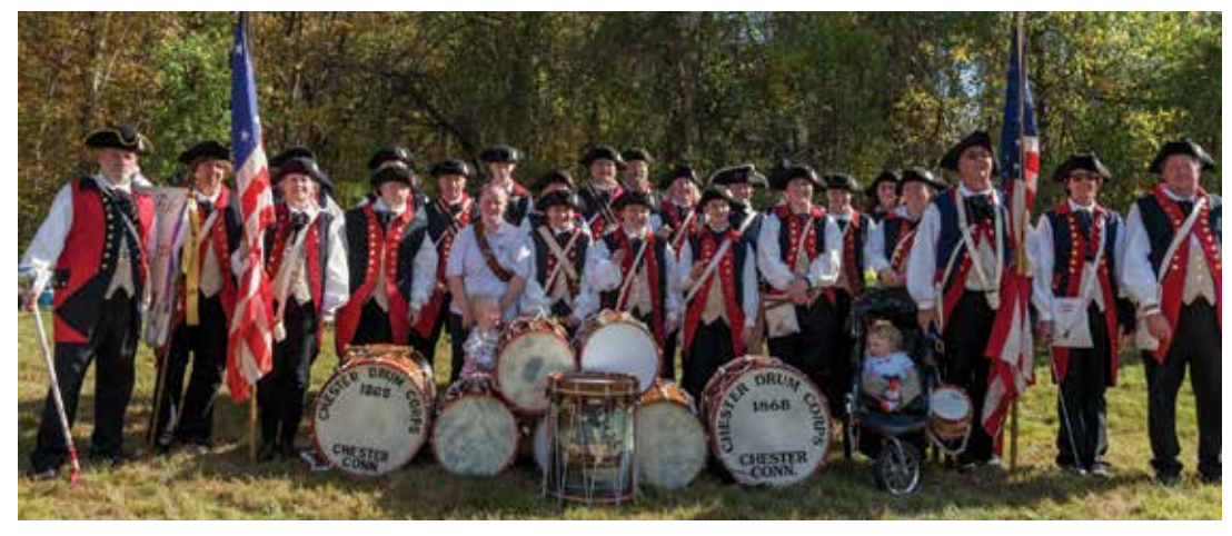
We have 9 Fifers, 7 Snares, and 5 Bases, plus 9 in our Color Guard and our official Corps Photographer.

As we start the year 2018, it is with great pleasure that I report, that the Chester Fife and Drum Corps had a banner year. We enjoyed the camaraderie of each other as we marched pretty much all over New England. It looks like 2018 will be just as busy, especially with our muster coming up on September 22, 2018.